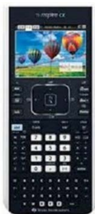
TI-nSpire CX (with white center keypad)