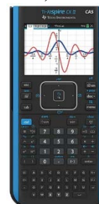
TI-nSpire CX II CAS (black face, blue border)

Some advanced CAS features will be required to be disabled on assessments.